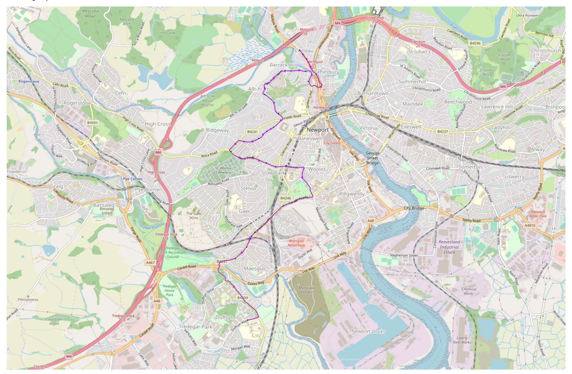
YGI1 - Ysgol Gyfun Gwent Is Coed AM